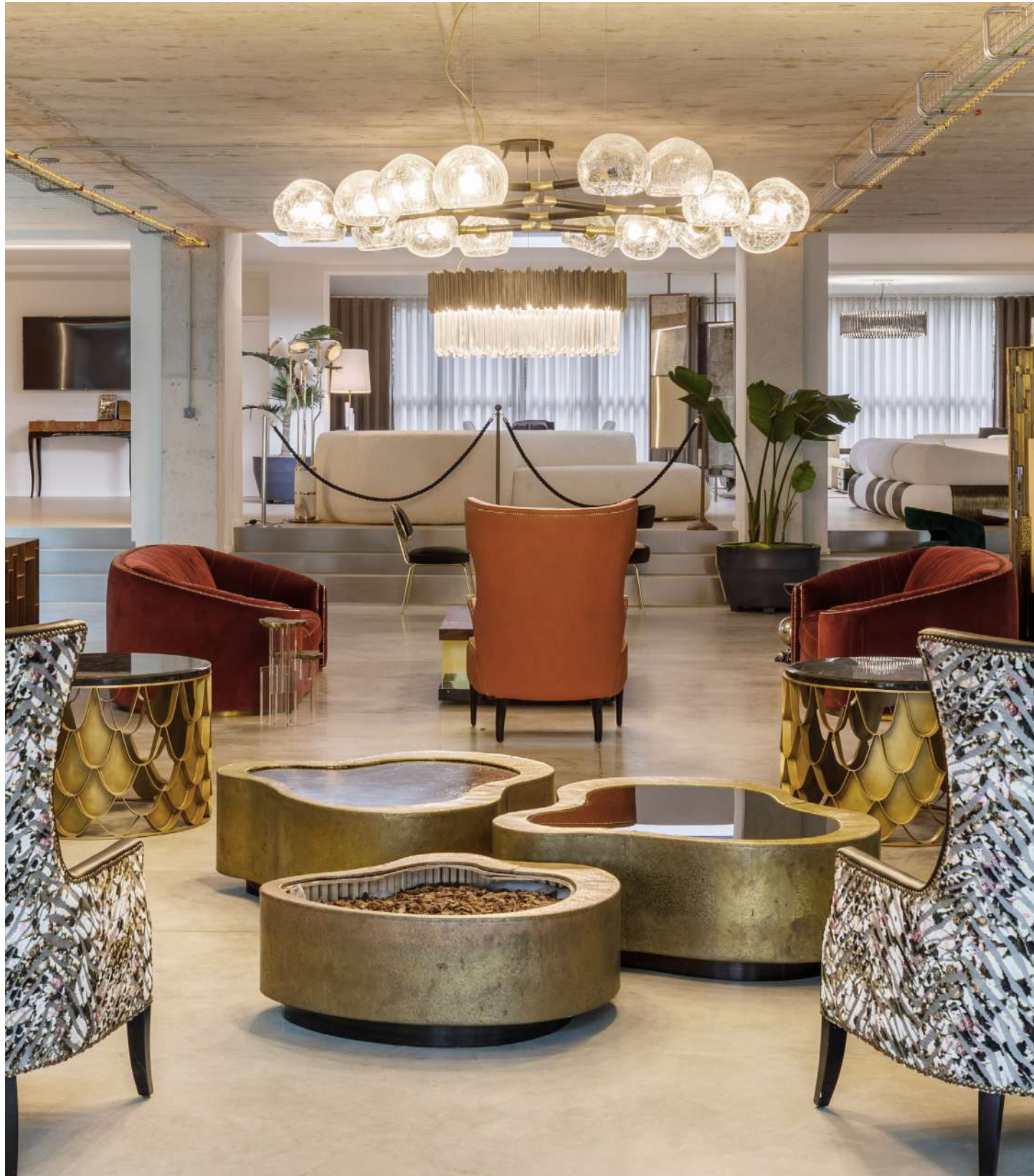
Our inspirational journey begins on the first floor which focuses on contemporary design . Different room concepts and lounge areas present a mix of high-quality materials and craftsmanship with modularity and comfort.